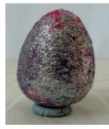
Pink Sparkle Disco Egg by Peggy Age 4