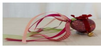
Is it a narwhal or unicorn? By Grace , Age 4