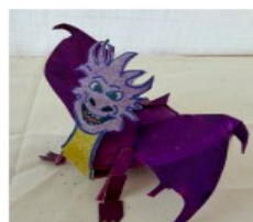
Untitled by Hollie