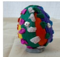
Untitled by Kacper Age 5