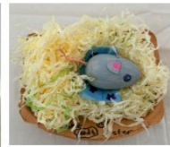
Untitled by Esme Age 10