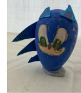
Sonic by Noah Age 8