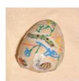
Oscar, Age 5