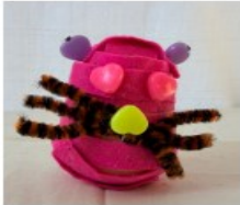
Pink Cat by Grace Age 5