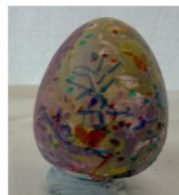
Rainbow Explosion by Beila Age 7