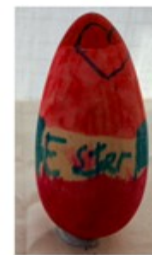
Happy Easter by Tilly Age 11