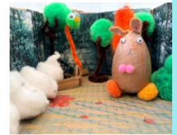
Untitled by Elsie