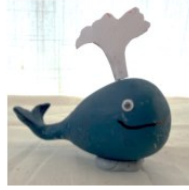
Wallace the Whale, by Fergus