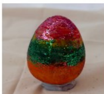
Untitled by Grace