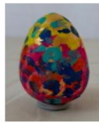
Spotty Egg by Silvia Age 4 -