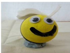
Untitled by Skye, Age 6