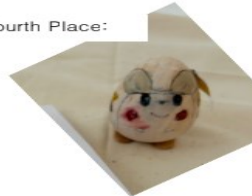
Togi (an electric type Pokemon) By Gale, Age 6