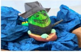
Dinosaur Pirate in a stormy sea, by Ned, Age 5