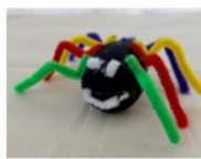
Untitled by Brodie