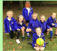
Cross country and girls' football at Wallop School

Well done to all of our children who have made a fantastic start to the 2024– 2025 academic year.