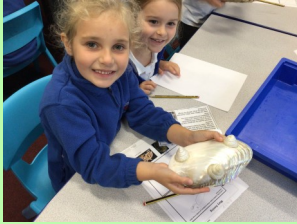
Mary Anning Workshop