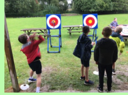
Personal Best Sports day (despite the rain)!