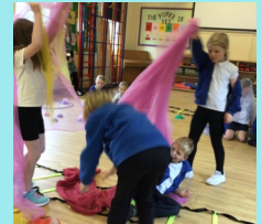
Pretending to slay a dragon

In outdoor PE, we have been orienteering around the playground.